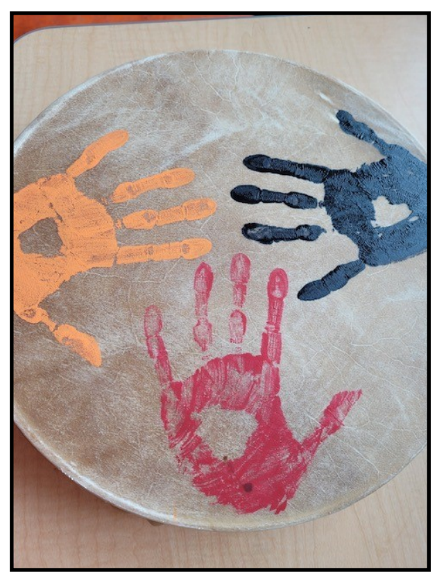
A beautiful drum made by one of our talented students during a drum making workshop!